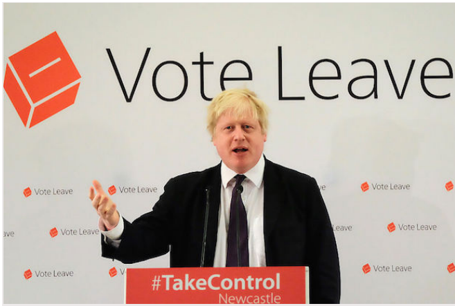
Has Boris Johnson's defection to 'Out' scuppered the sovereignty bill?