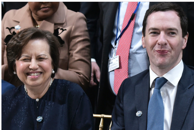
The prospect of Brexit is already damaging growth, but Osborne doesn't care