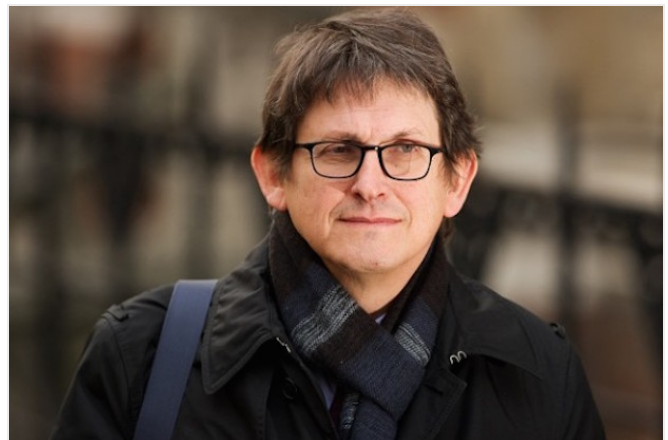
Alan Rusbridger suffers the ultimate indignity at the hands of the Guardian