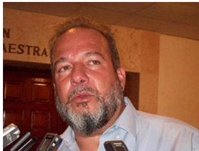
Manuel Marrero, Cuban minister of Tourism, noted that the island's aviation sector is undergoing renovations in order to improve the quality of services.

This situation therefore suggests an increase in flight connections and more tourists for 2016. This year saw the launch of new routes such as the return of Spanish airline Iberia, June 1, with five weekly flights.