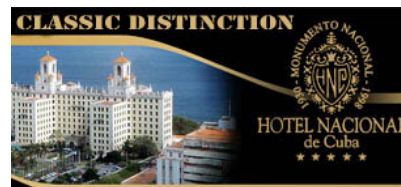
( http://www.hotelnacionaldecuba.com/sp/home.asp )