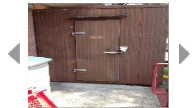
International Walk-in Cooler